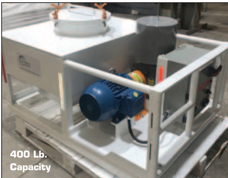
400 Lb. Capacity

Matrix Design Group is an authorized distributor of CBS Equipment