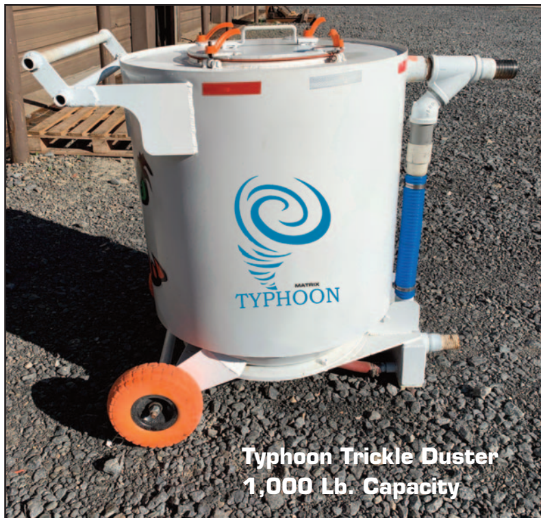
Typhoon Trickle Duster 1,000 Lb. Capacity