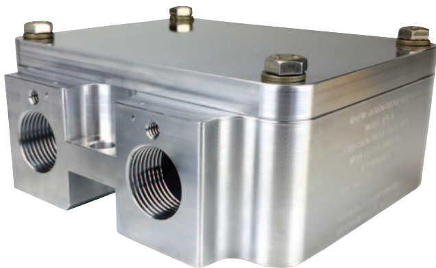
MODEL XPE-4 XP SQUARE ENCLOSURE WITH LID

CONTACT YOUR MATRIX REP FOR MORE INFORMATION