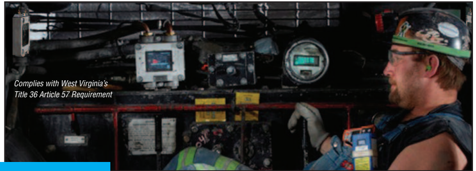
Complies with West Virginia's Title 36 Article 57 Requirement

Improved vision in low-light conditions helps operators make decisions when they approach miners or other mobile equipment, and can help reduce damage to offside rub rails, tires and trailing cables.