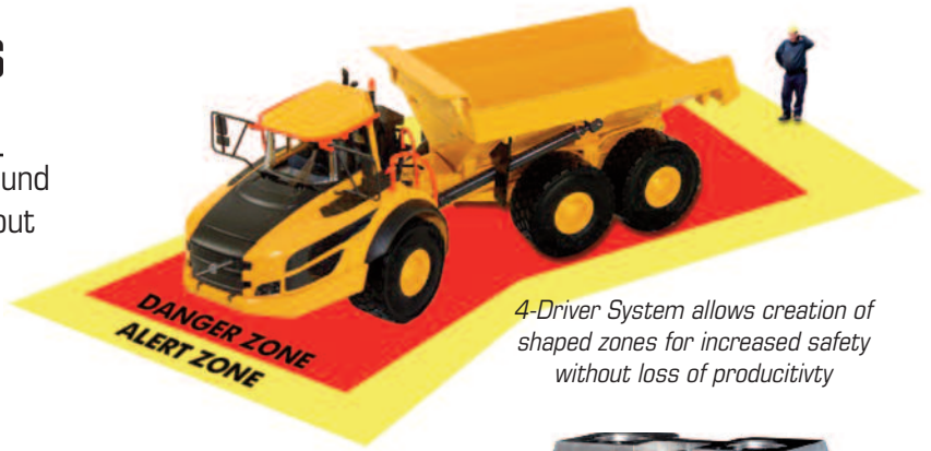
4-Driver System allows creation of shaped zones for increased safety without loss of productivity