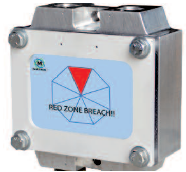
In-cab Directional Display for 4-Driver System (optional)